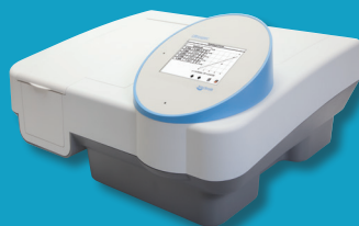
Ultrospec 7000 / 8000 / 9000

IQ/OQ documentation does not include the engineer's time. A minimum of 2 days will be charged. IQ/OQ can only be performed by qualified service engineers and not by the end user.