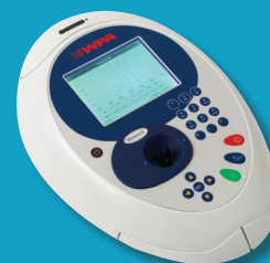
WPA Biowave / Lightwave