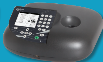
Libra S4 + / S6 +