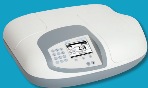
Ultrospec 2100 Pro

For labs seeking a balance between essential support and cost, we also offer Silver and Bronze Maintenance Contracts. Customers with Silver contracts receive one preventative maintenance and one breakdown visit. Bronze customers receives one preventative maintenance visit only.