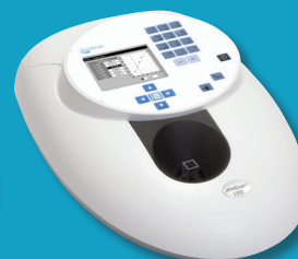
GeneQuant 100 / 1300